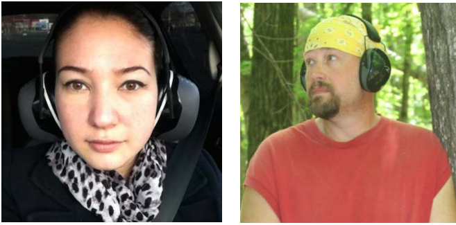
Two “Faces of Hyperacusis”

He ended the introduction with examples of how sufferers themselves are having an impact by writing media stories (most recently on the medical news site StatNews) and by assimilating scientific knowledge into everyday language that helps patients understand the research (as in the website www.hyperacusisfocus.org ).